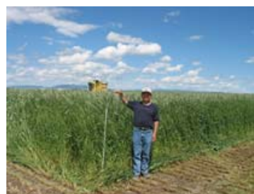
Dr. Chengci Chen (Central Ag Research Center) in a field of winter triticale for silage and ethanol (MSU 2006)

The MSU Biobased Institute supports cutting-edge research to improve the profitability of Montana agriculture through enhancement of current production and development of new value-added applications and products. The Institute strives to be innovative and responsive to the developing needs of the State of Montana and the Pacific Northwest/ Northern High Plains regions. The primary objective of our research is to develop value-added, agriculturally based end-use products with a competitive edge in the global market that are suitable for production in rural Montana.