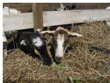
Camelina-fed goats at the Almaltheia dairy (Belgrade, MT)

The Biobased Institute provides funding to MSU researchers who work directly or indirectly with Ag producers and manufactures to enhance Montana products or to develop new products/applications. The biobased Institute currently supports 14 research projects targeted at improving Montana agriculture. Descriptions of each project can be accessed by linking to the researcher or to the project.