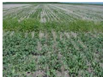
Biodiesel Oilseed trial at the Central Ag Research Center

The Biobased Institute provides funding to MSU researchers who work directly or indirectly with Ag producers and manufactures to enhance Montana products or to develop new products/applications. The biobased Institute currently supports 14 research projects targeted at improving Montana agriculture. Descriptions of each project can be accessed by linking to the researcher or to the project.